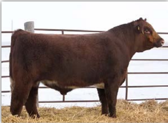
JSF WALL STREET 70E

Foundation Female of the "Princess" Family lots 1, 2 & 4