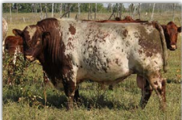
SASKVALLEY GLAM 68G