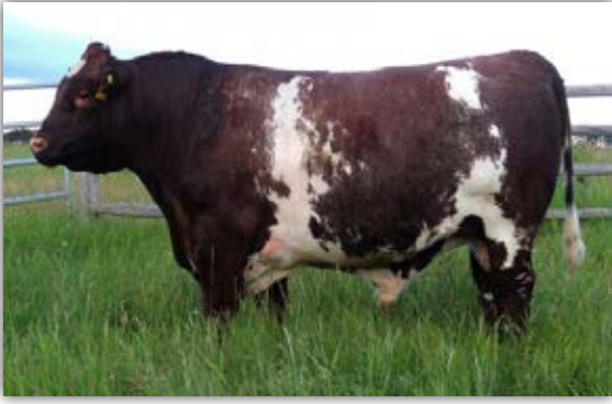
BELL M SKECHERS 87D