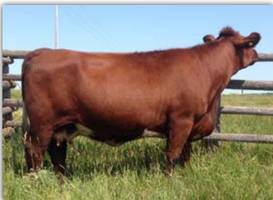
UPHILL PRINCESS 9A

Foundation Female of the "Princess" Family lots 1, 2 & 4