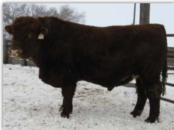
SASKVALLEY HAGGAED 271H