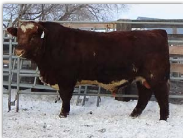
SASKVALLEY FLAGSTAFF 254F